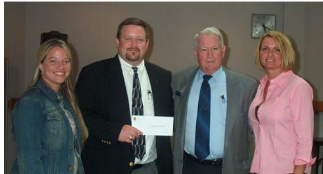
Walter Wellborn Elementary School Receives Three-Year Grant